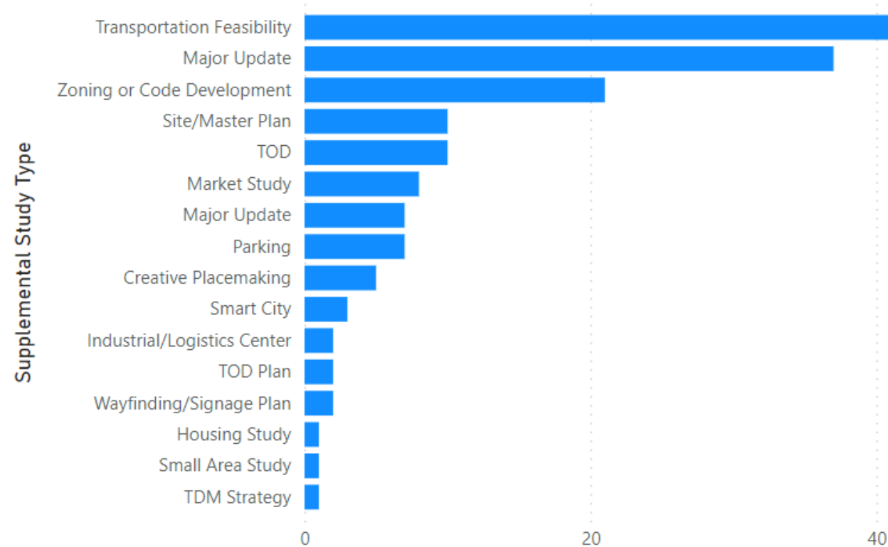
Supplemental Study Type by Supplemental Study Type