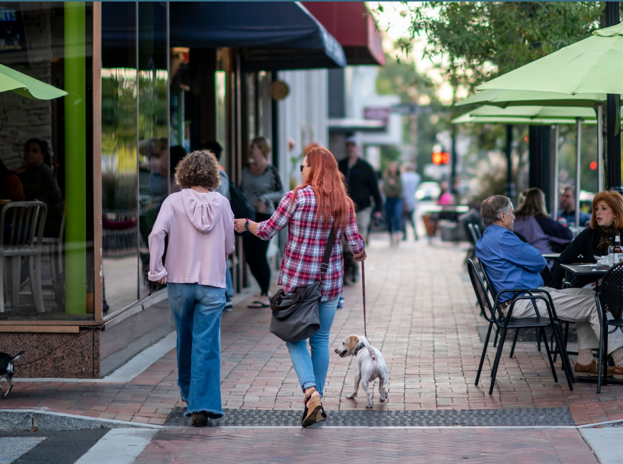
MAIN STREETS & DOWNTOWNS