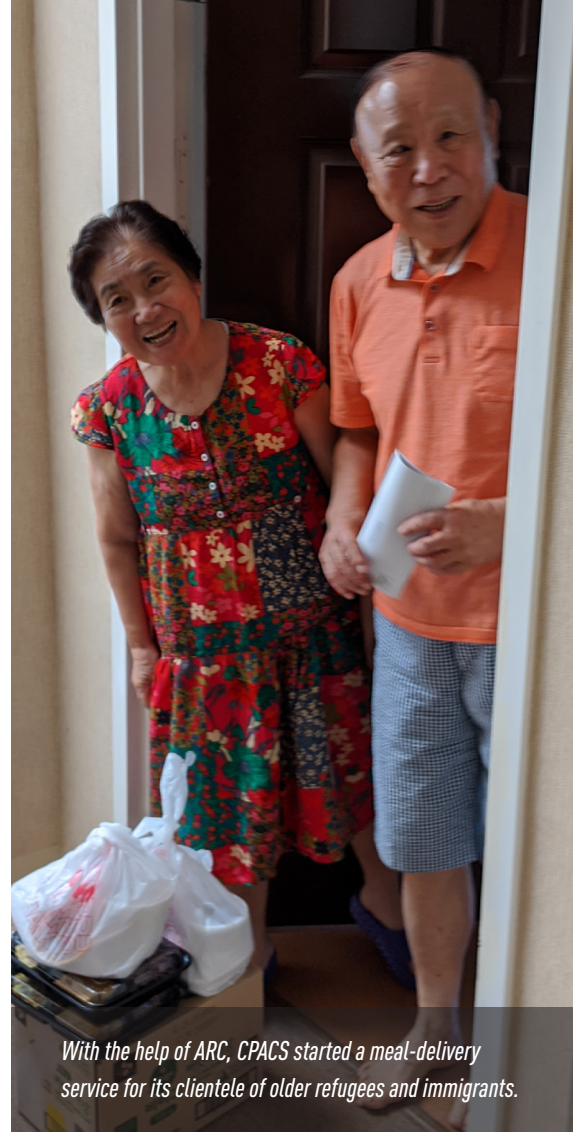
With the help of ARC, CPACS started a meal-delivery service for its clientele of older refugees and immigrants.